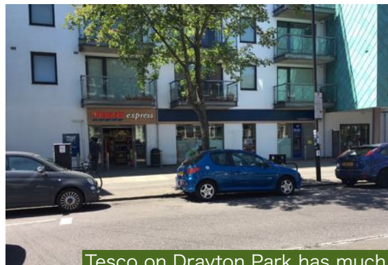
Tesco on Drayton Park has much more space for deliveries

HCA has been active in collecting signatures, attending meetings and writing an Association response to the new bid.