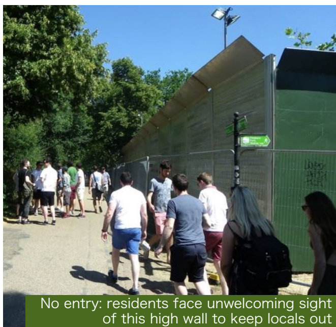
No entry: residents face unwelcoming sight of this high wall to keep locals out

‘Although we have lost this legal case, we have done much to raise awareness of the importance of our public parks and green spaces. This would not have been possible without your help and financial support.’