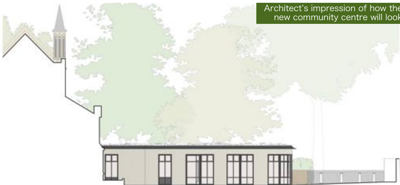
Architect's impression of how the new community centre will look