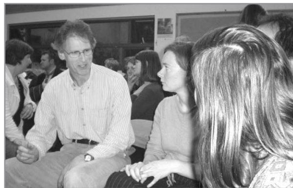
HCA, FOG AND ISFOE COMBINED THE END OF SUBURBIA SCREENING

solar panels to sun tubes, was perfect inspiration. Indeed the building has become the first carbon neutral property in Islington thanks to the recent installation of a wood pellet (biomass) boiler to cover its minimal heating needs. For those of us shivering through the winter in Highbury's typical draughty Victorian terraces (or baulking at rising heating bills), the Centre's insulation is an eye-opener. You can see for yourself if you visit on the afternoons it is open (Tuesday and Thursday).