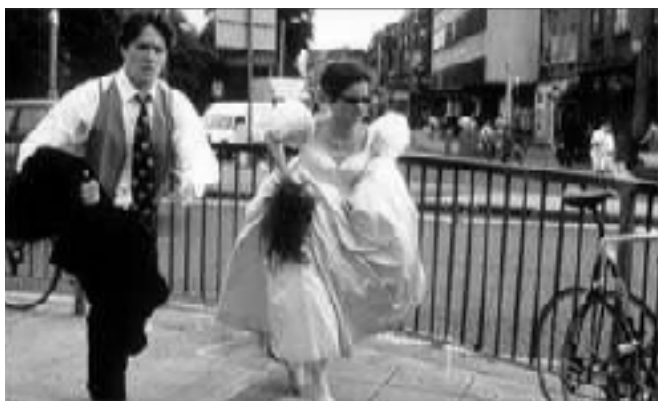
HIGHBURY CORNER, LOOKING TOWARDS UPPER STREET

The area around Highbury Fields was used for a number of scenes in Four Weddings and a Funeral (1994). The flat shared by the characters played by Hugh Grant and Charlotte Coleman was at 22 Highbury Terrace. The exterior of this house featured in a number of scenes, usually with the actors rushing out the front door because they were late for a wedding, and including the famous scene in the rain with