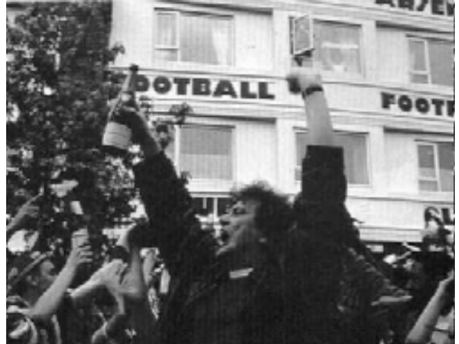
HIGHBURY STADIUM WEST STAND

The film which features Highbury most prominently must be Fever Pitch (1997). Based on Highbury resident Nick Hornby's classic football memoir, it stars Colin Firth as Arsenal fan Paul, Ruth Gemmell as his girlfriend Sarah, and