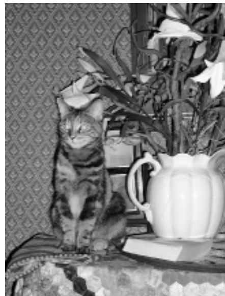
TIGER LIL POSES BY HER FAVOURITE FLOWERS

is back with me - it is really strange and magical." ■