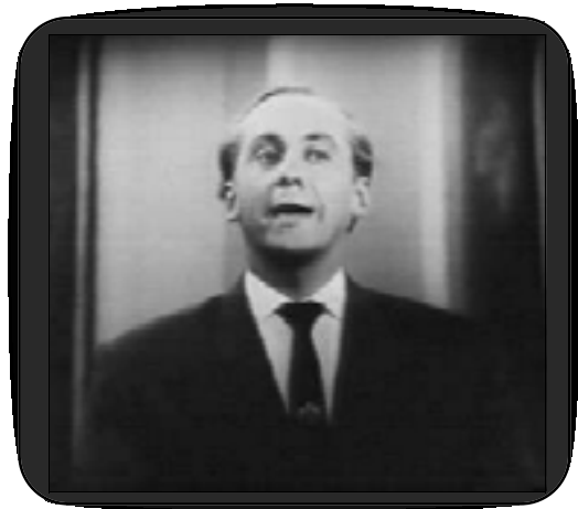
HUGHIE GREEN OFFERS TO 'DOUBLE YOUR MONEY' AT HIGHBURY STUDIOS

and decided to concentrate film production at Pinewood Studios. That year Highbury Studios was sold to High Definition Films, owned by Norman Collins - one of the leading lobbyists for the introduction of commercial television. In addition to film work (Orson Wells was there for a week recording extracts from Shakespearian drama) the studios were used for the development of television cameras, and for making mock television commercials - used to lobby Members of Parliament that commercial television was not such a bad thing!