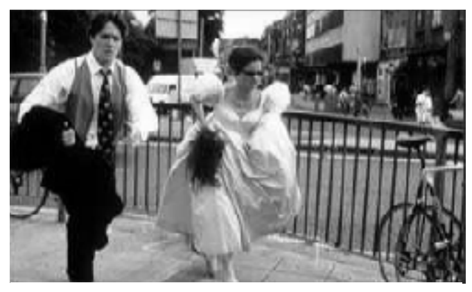
HIGHBURY CORNER, LOOKING TOWARDS UPPER STREET

The area around Highbury Fields was used for a number of scenes in Four Weddings and a Funeral (1994). The flat shared by the characters played by Hugh Grant and Charlotte Coleman was at 22 Highbury Terrace. The exterior of this house featured in a number of scenes, usually with the actors rushing out the front door because they were late for a wedding, and including the famous scene in the rain with