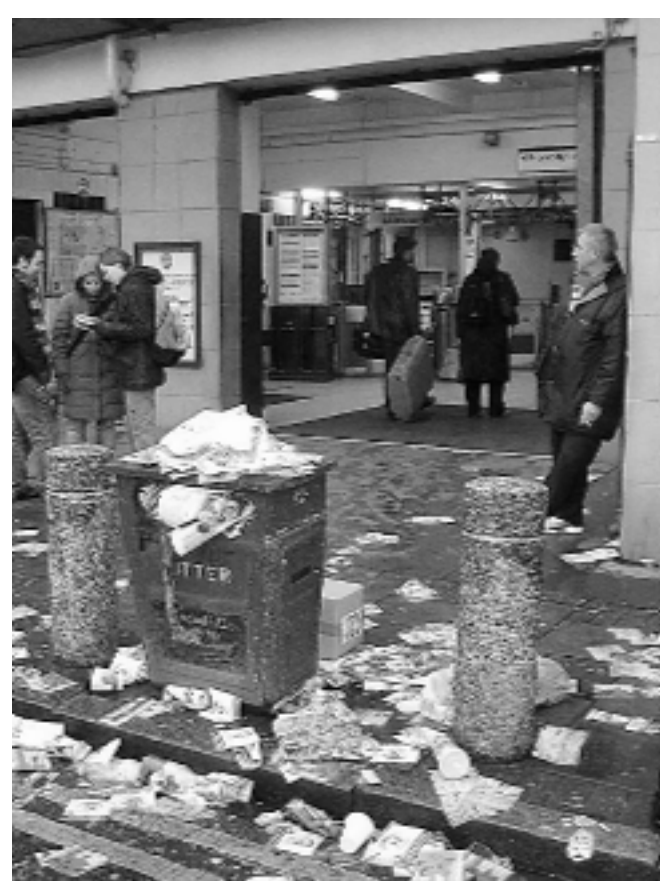
MATCHDAY AT ARSENAL TUBE STATION

Surely there are possible solutions to this aesthetic eyesore: many extra rubbish bins, or even skips, around the stadium on match days, including special ones for recyclable stuff, outside Arsenal tube and on nearby corners. Or, perfectly possible traffic wise, a quick round by the street cleaners to empty all the rubbish bins - while the match is on and fans safely installed inside the stadium - in preparation for their second time use. The surrounding roads are then deserted, empty and quiet. Wouldn't this be more labour saving for the