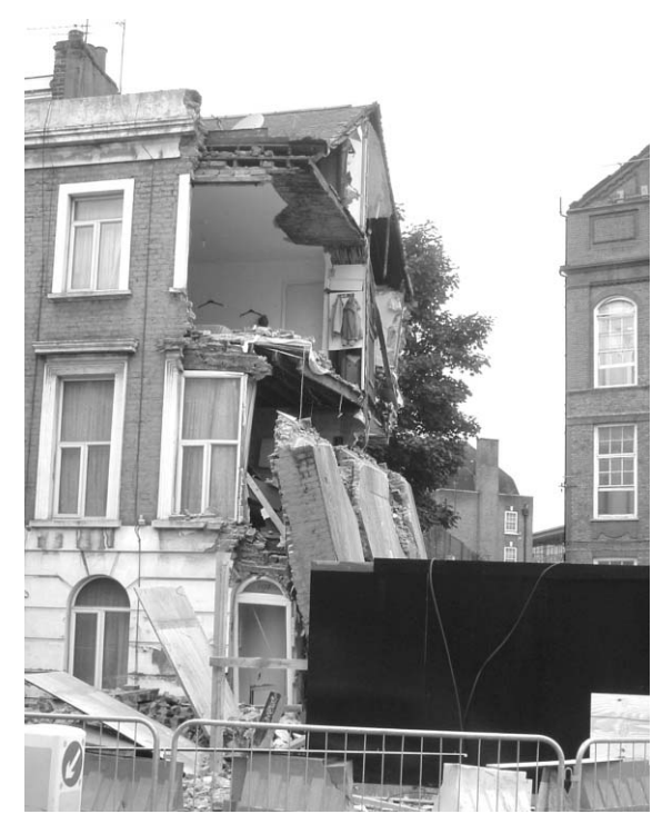
NO 101 BENWELL ROAD, REDUCED TO RUBBLE

It isn't clear who the building contractors are, or the involvement of the Council's Building Control department, but the Government's Health and Safety Executive were called in to investigate how this potentially fatal mistake happened.