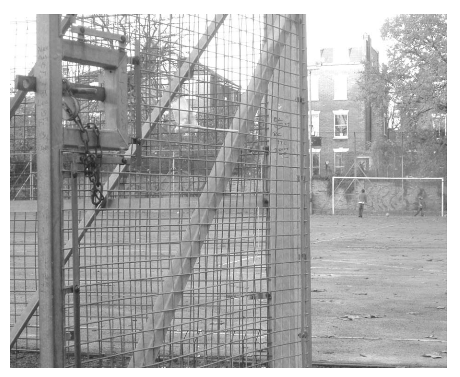
Highbury Fields football pitches — open to local children for now

Faced with such opposition, the Council conceded that it ought to hold a public meeting at which these issues could be discussed. That meeting was scheduled for