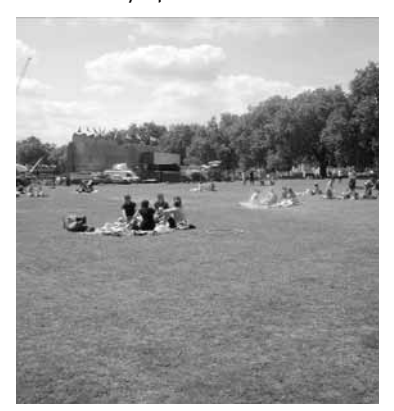
Are some of our trees under threat from Massaria? Is the grass under threat from barbecues?

However, it is likely that the Massaria fungus is woken from dormancy by the reduction of water flowing through the bark when a dry spell forces the tree