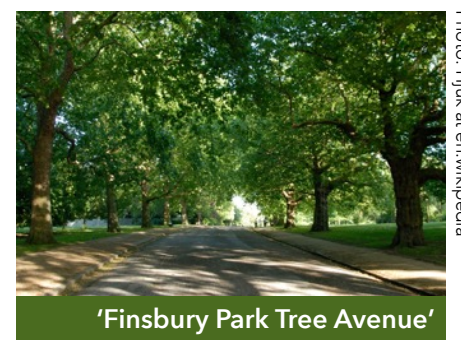
'Finsbury Park Tree Avenue'

For information visit facebook.com/finsburyparkfriends