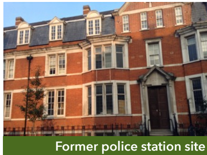
Former police station site

An existing Sainsbury's Local can be found further down Blackstock Road, less than half a mile away from the proposed development.