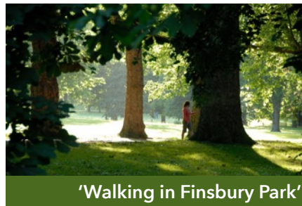
'Walking in Finsbury Park'

Designated as common land, demonstrations were allowed and, during World War One, there were many disturbances between pacifists (at times, attended by Sylvia Pankhurst) and troops, spilling out into the surrounding streets. Next were the Brownshirts